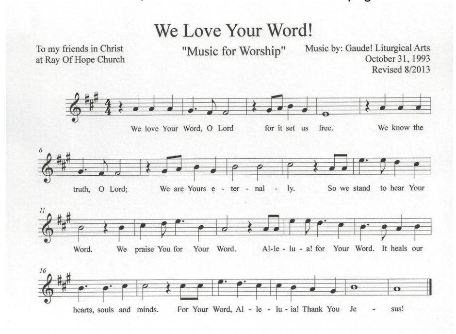
December 4, 2022 Advent Week II Year A page: 14

©1993 by Gaude! Liturgical Arts. All Rights Reserved. International Copyright Secured. Reprinted here under CCLI#706121